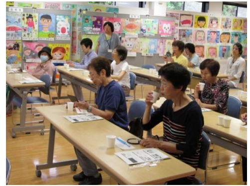
『Waku-waku Health Class』 June 2014 Topic: Teeth

Here at Beppu Municipal Health Promotion Division, we decide on a topic once a month and hold Health Classes/Health Consultations "Kenko Waku-waku Health Classes". The topics are listed on the Beppu City Bulletin. Please bring your checkup results and come join us.