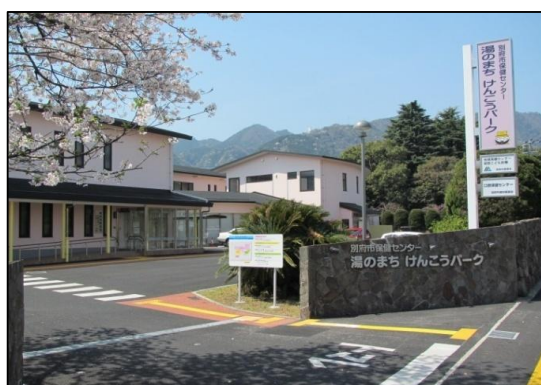
Map for Beppu Health Center